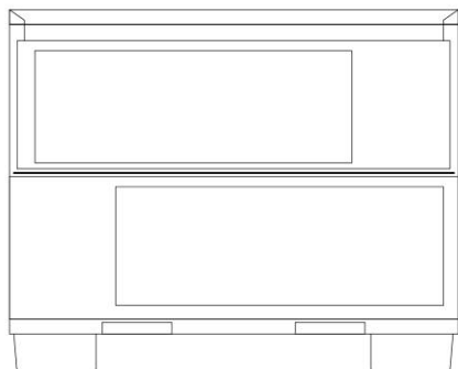
Length view 1.200 mm