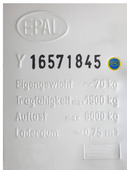
EPAL Box Pallet (identification plate)