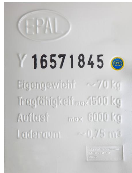
EPAL Box pallet (identification plate)