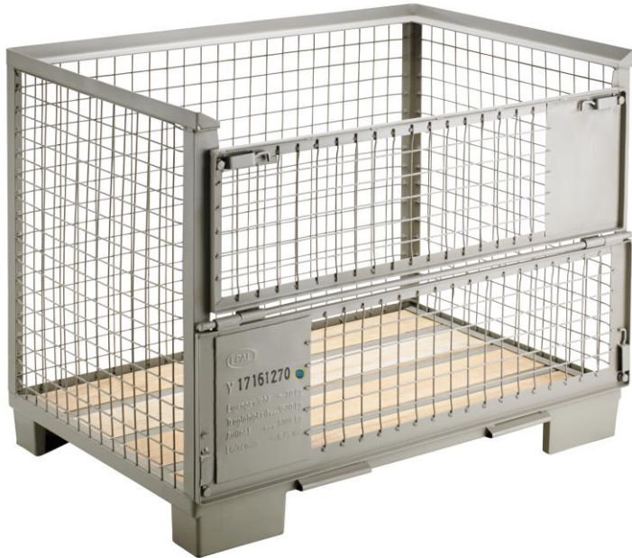
EPAL Box pallet