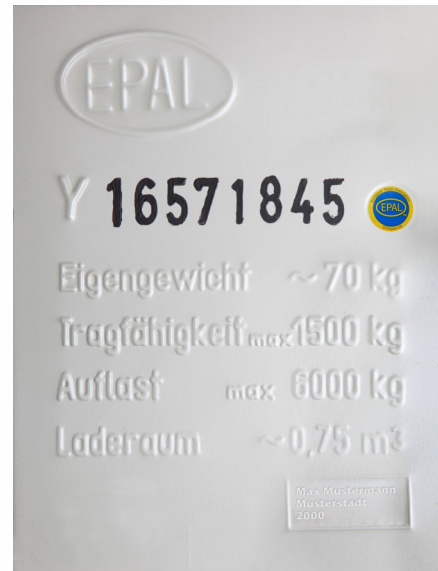
EPAL Box pallet (inscription plate)